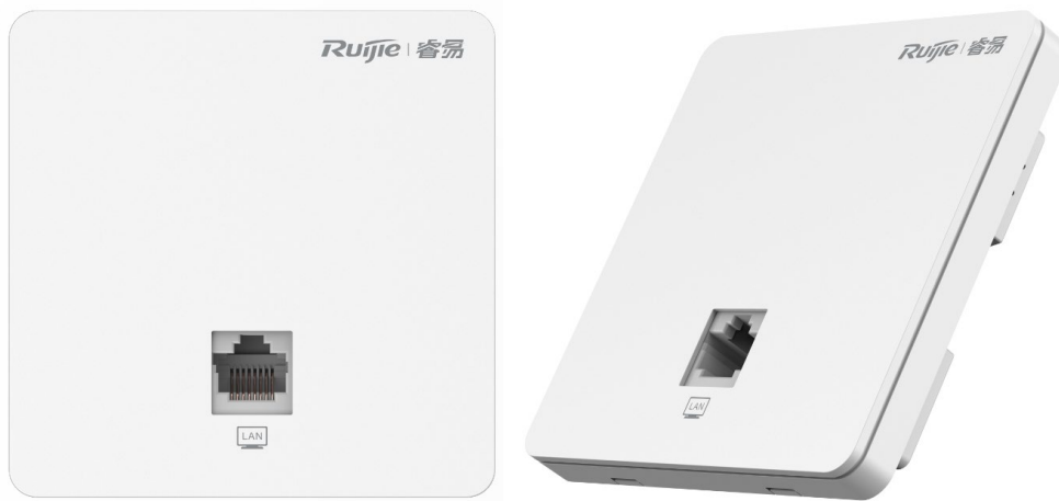
Figure 1-1 RG-RAP1200(F)