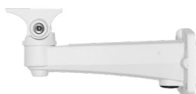
ZN - BK346A Wall bracket