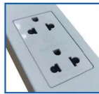
Safety Shutter TIS Outlet