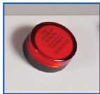
LED Pilot Lamp